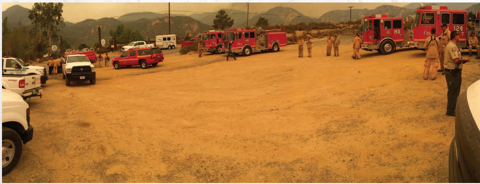
Officers co-locate with Fire personnel to provide a coordinated response