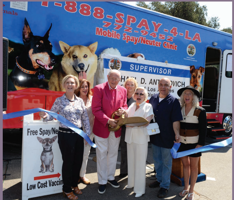
Ribbon cutting ceremony for mobile clinic at La Crescenta dog park.

For information about obtaining services, call 1-888-SPAY-4-LA (772-9452) or visit the website at www.1888spay4la.org .