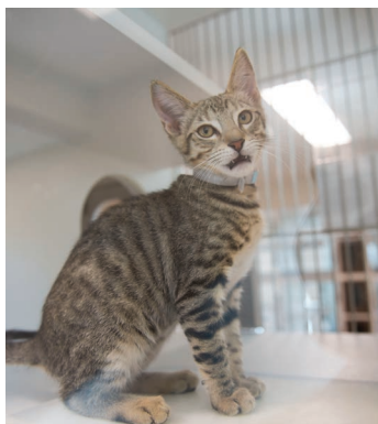
This kitty found a home