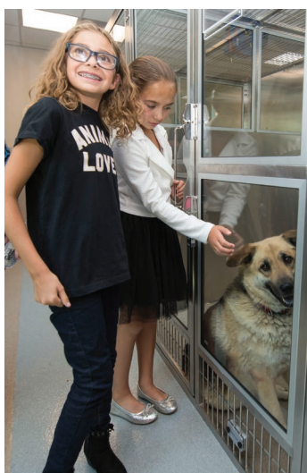
Dog adoption area

The Palmdale ACC is open seven days a week and is located at 38550 Sierra Highway in the city of Palmdale.