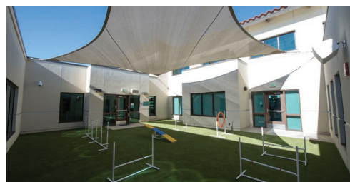
The dog agility yard