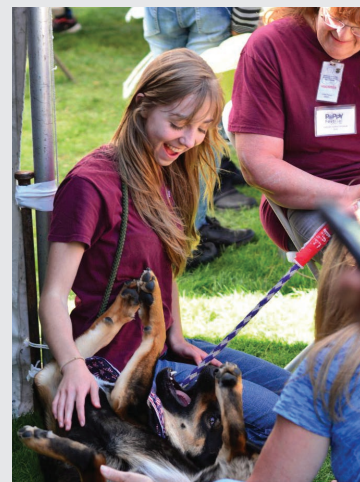
Diamond loved the attention and belly rubs by DACC volunteers