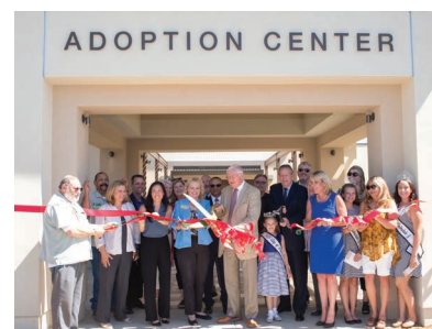
Ribbon cutting ceremony