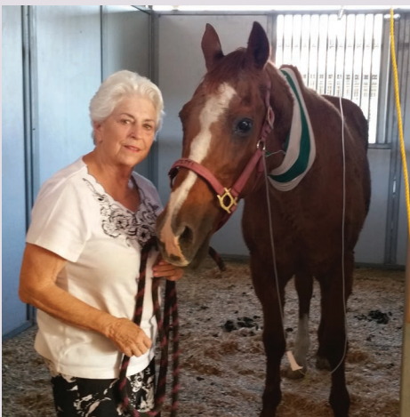
Horse receiving fluids, with owner, at Pierce College