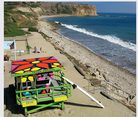
An LA County lifeguard tower transformed by POH art.