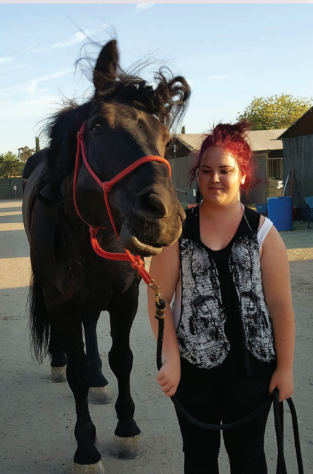
A Percheron horse evacuee at Hansen Dam