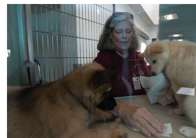
Volunteers found homes for these foster pups that day